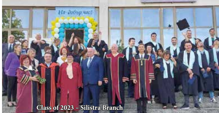
Class of 2023 – Silistra Branch