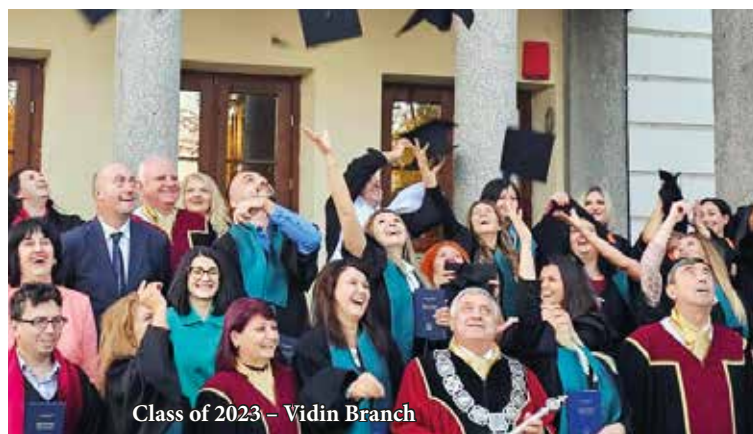
Class of 2023 – Vidin Branch

The solemn ceremony on the occasion of the opening of the new academic year for the first-year students from the Vidin Branch of the University of Ruse and the graduation of the class of 2023 began with a procession, to the sounds of the City Brass Orchestra. In the building of the „Vladimir Trendafilov“ drama theatre, a total of 103 graduates received their diplomas for a completed bachelor's degree of higher education, of whom two were full honours. In the academic year 2023–2024, 143 new students are beginning their studies at the Vidin branch.