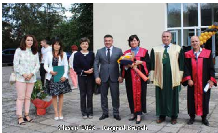
Class of 2023 – Razgrad Branch